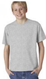
Item #29TEE 50/50 Short Sleeve Tee

Youth S, M, L - $23.00 Adult S, M, L, XL - $23.00 Adult 2XL - $25.00