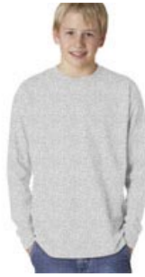
Item #2400LST Long Sleeve T-Shirt

Youth S, M, L - $11.50 Adult S, M, L, XL - $12.00 Adult 2XL - $14.00