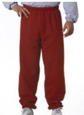
Item #973SP Sweatpants Elastic Waist with Drawstring, elastic cuffs