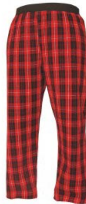
Item #FSP Flannel Pants 100% double-brushed cotton flannel, elastic waistband Color: Red/Black Plaid Youth S, M, L - $22.00 Adult S, M, L, XL - $22.00

Youth S, M, L - $17.00 Adult S, M, L, XL - $17.00 Adult 2XL - $19.00