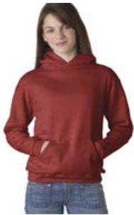
Item #996HS Hooded Sweatshirt

2-color Screen Printed Design on Full Front